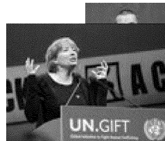
Helen Bamber Foundation Suzanne Mubarak

Women's International Peace Movement STOP THE TRAFFIK Ricky Martin Foundation U.N. Office on Drugs and Crime